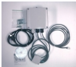
Photo Eye Kit Model # KT-2764-031 Power Cord & Cables # KT-2764-034

For sensor count process- This kit includes an ABS box, run/hold switch, retro-reflective photo eye and reflector. Parts pre-wired with 15 ft. cable. Eye distance spec 3-5 meters.